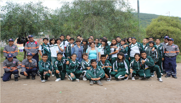
220 middle school students

Competencies strengthening for sustainability (UNESCO): Systemic thinking, critical analysis, collaborative decision making, sense of responsibility towards present and future generations.