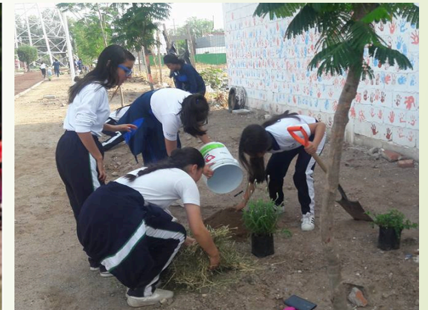
1 park intervention