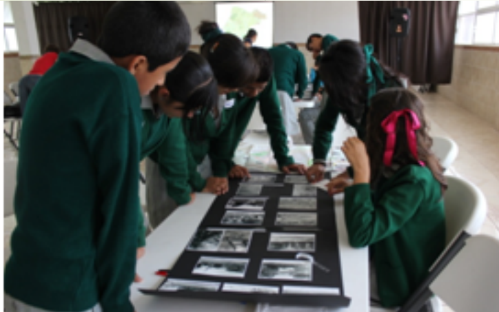
Workshops at schools