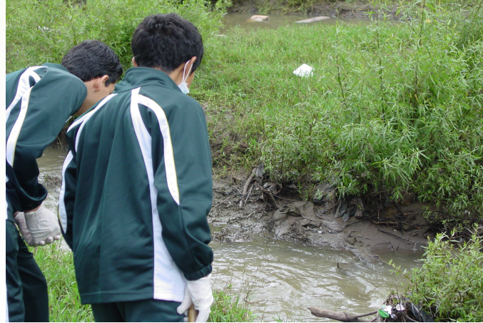
Workshops in nature