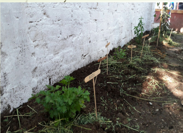
3 school gardens

Enrich our knowledge of the world , from a systemic perspective, to understand and transform our urban, local environment towards sustainability and resilience