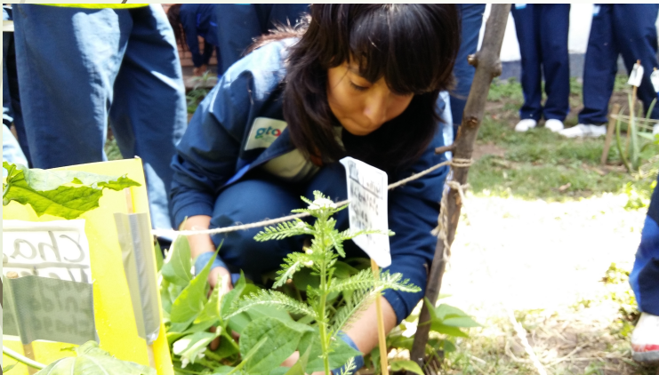
Pollinator and Vegetable Gardens