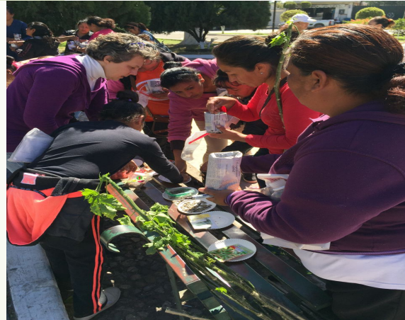
195 women of social program (Programa Oportunidad)